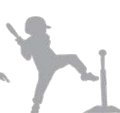
T-BALL (Junior Preparatory)